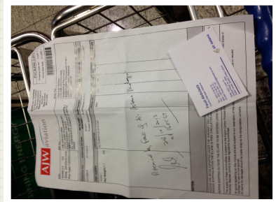
PROOF OF DELIVERY