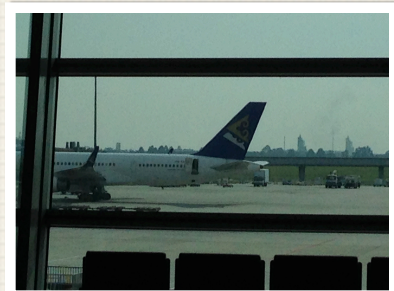
AOG - AIRPLANE ON GROUND