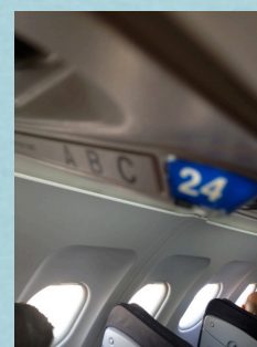
Let the Journey Begin - the 1st seat selection of the experience.