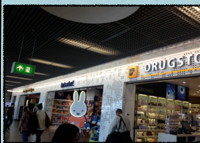
Just a peek at the shopping opportunities in Amsterdam.